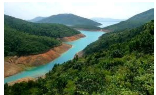
Fig 1. Reservoir in Hong Kong