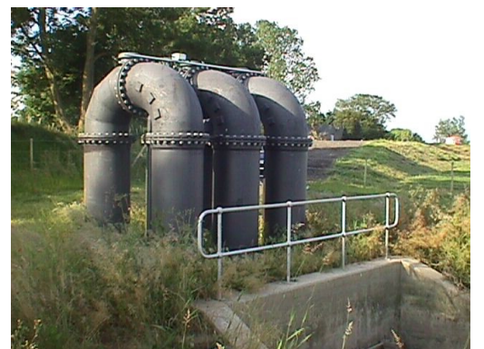
Fig 2. Siphon Breaker Valves from Bedford Pumps

A Siphon Breaker Valve is effectively a small paddle operated butterfly valve fitted with an extended spindle. The valve is normally open so that when the pump starts air in the pipeline is emitted through the valve until the rising water column acts against the paddle attached to the end of the spindle and closes the valve. Once closed, the pipeline becomes primed and a siphon is established. Forward direction of flow maintains the pressure on the paddle keeping the valve closed and maintaining the siphon. The siphon is broken when the pump stops; the reverse flow acts on the paddle and opens the valve, thereby destroying the vacuum in the pipe and preventing continuous reverse flow through the pump.